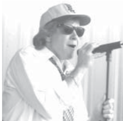
Eddie Money headlined 2005's Crystal Coast Bike Fest held Sept. 24 at the Craven County Fairgrounds.