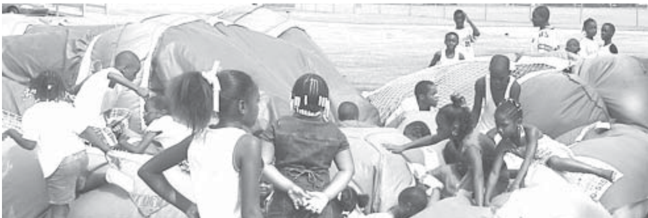
Below: Children crawl over a deflated 'moonwalk' during Duffest held in late September at Stanley White Recreation Center.